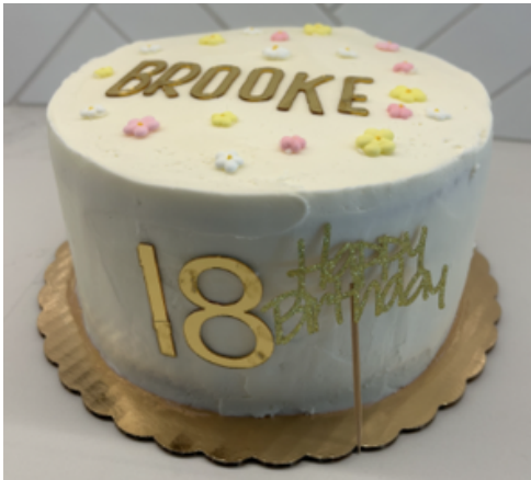
His decorating skills have definitely gotten better! (1 year after)