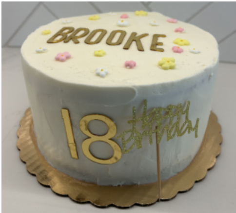
His decorating skills have definitely gotten better! (1 year after)